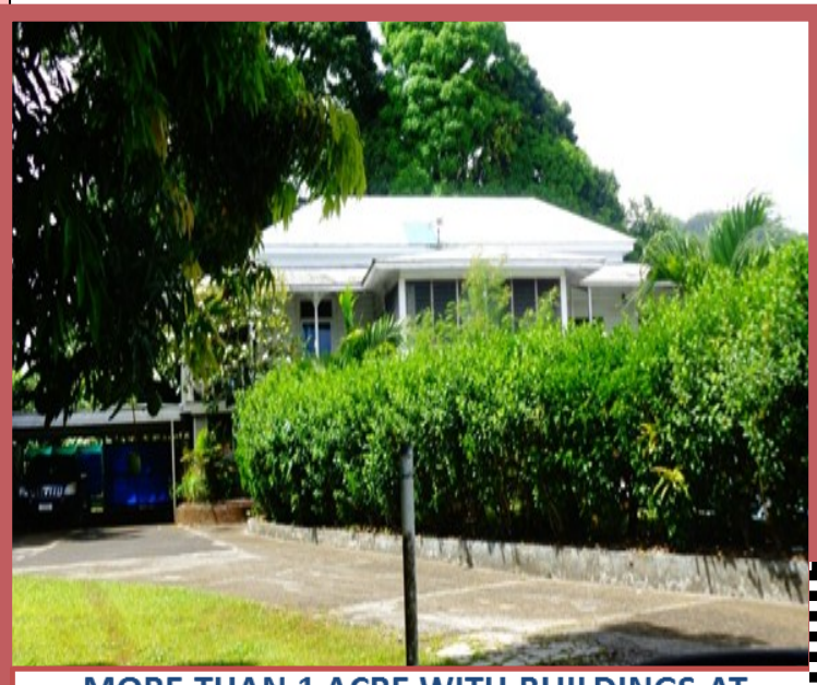
MORE THAN 1 ACRE WITH BUILDINGS AT MOTOOTUA - $1.7million ONO. LOCATED NEXT TO RED CROSS & NKF.