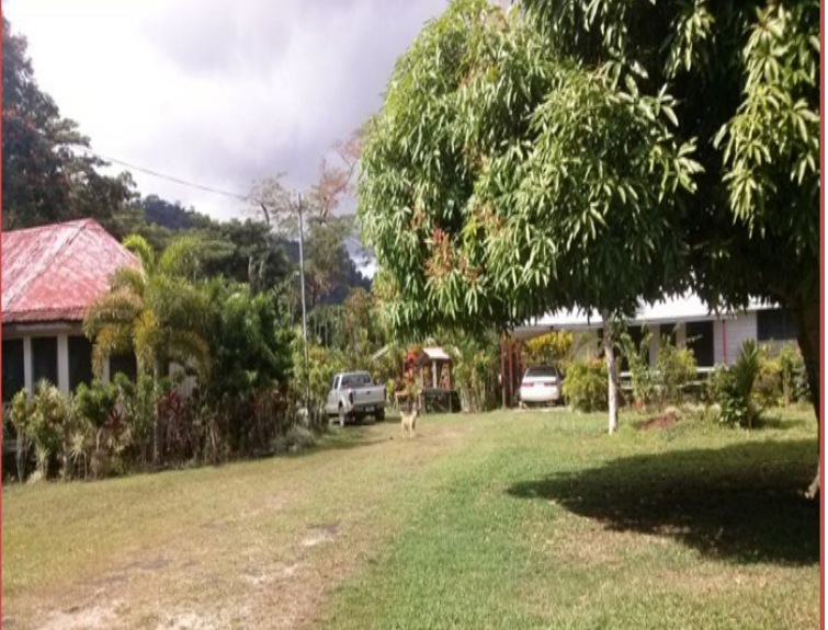
MORE THAN ¾ acre WITH 3 HOUSES AND CHAIN FENCE AT MOAMOA - $500,000 ONO.