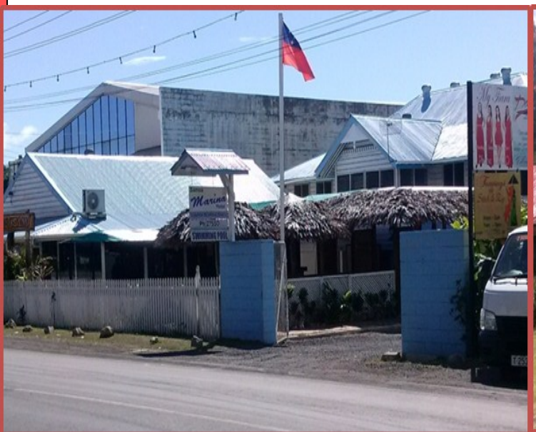
MORE THAN ½ ACRE WITH A HOTEL AT MATAUTU TAI (SAMOA MARINA HOTEL) : $4.6million reduced to $4million ONO.